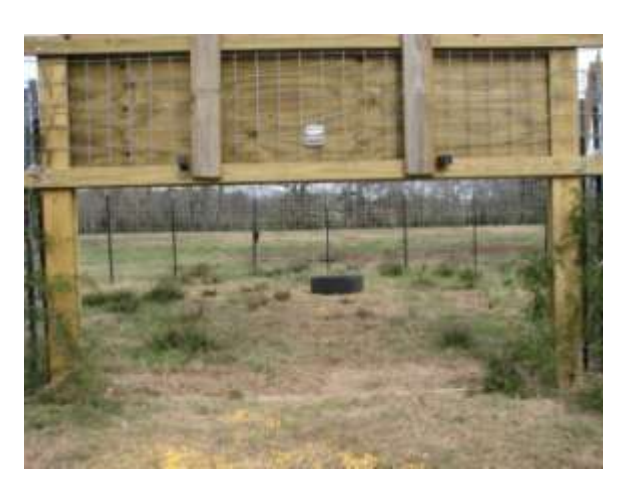
Over time, concentrate baiting deeper inside the trap with a minimum of bait placed on the outside. The wider gate opening generally reduces the training time required.

Once the pigs are entering through the gate consistently, continue to concentrate most of the bait deep inside the trap. When the pigs are consistently entering the trap through the locked open gate, you get to pick the day that you can set the trap to catch.