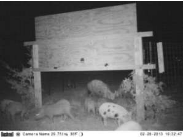
Pigs can be trained to accept the presence of a trap and begin to feed more inside over time.

As the pigs venture deeper into the trap, continue to reduce feeding outside and concentrate increasing amounts of bait toward the back of the trap where the trigger is routinely located. If a tire trigger is to be employed, go ahead and place the tire inside the trap so the pigs can become accustomed to its presence, eventually placing corn under and inside the tire itself so the pigs will equate it with food. If the throat of the trap was left splayed open, you can now set the gate in place with the door(s) locked open in order to train the pigs through the narrower opening. This may require placing bait both immediately outside and inside the gate threshold to encourage the pigs to enter the narrower opening.