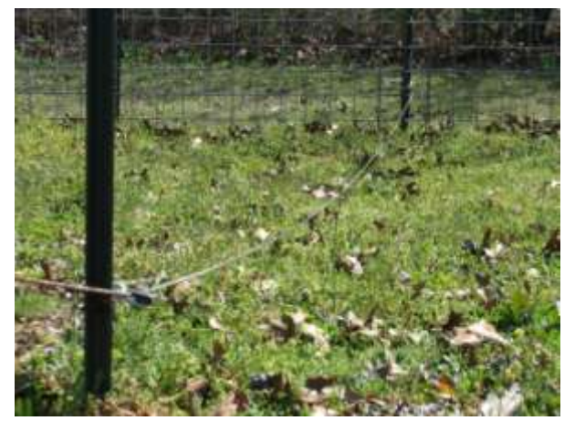
A trip wire trigger is commonly used in corral traps but is more easily tripped by smaller pigs as compared to the tire and rooter stick trigger styles.