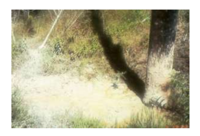
Watch for signs of wild pig presence including wallows and mud on trees and poles.

I often refer to adopting "best management practices" to be successful at reducing wild pig populations in order to reduce the damage these invasive exotics inflict upon the landscape. When it comes to baiting wild pigs for shooting or trapping, training the pigs to bait is critical.