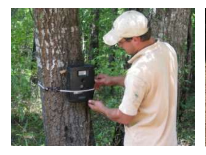
A trail camera records the times and dates as well as the number of pigs visiting a bait site.