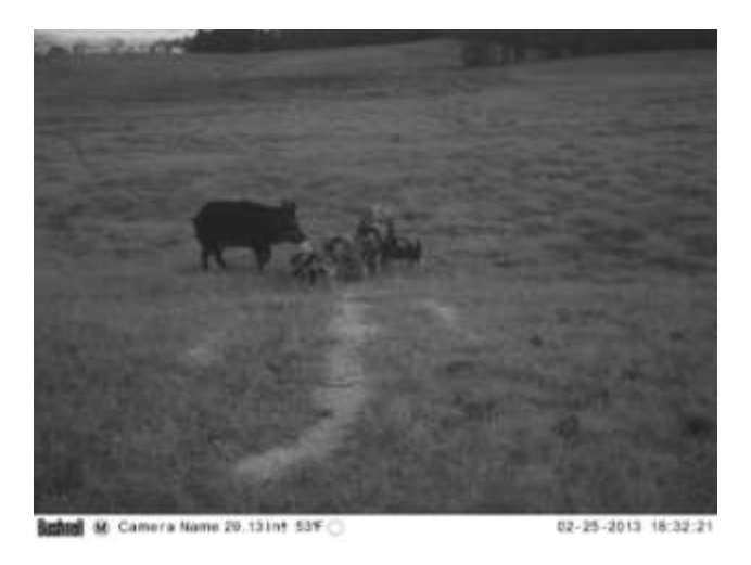
Pigs responding to a camera – monitored bait site. Monitoring is critical in pig removal.

Baits can differ and pigs often respond to different baits seasonally. The most difficult time to get pigs on bait is when native food items (e.g., acorns) or cultivated crops (e.g., peanuts, corn) are abundant. While shelled corn is the "gold standard" of pig baits, practically every species of critter out there also eats corn. Be creative—sour some grain for one bait site, use shelled corn at another or perhaps even try a dry dog food or cheese-based catfish bait in combination with corn or milo. Also, if you live outside Texas, check state laws and wildlife agency regulations regarding baiting before you proceed.