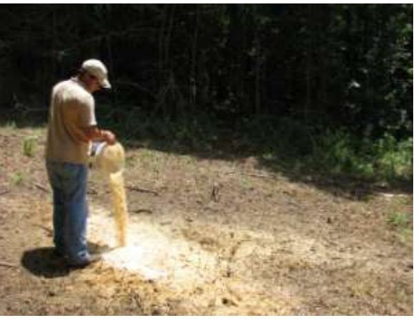
Bait should be distributed and monitored by trail camera.