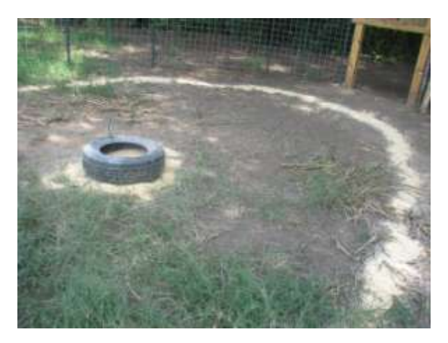
On the afternoon before setting the gate to catch, bait heavily around the trigger (left) and also place bait in a line around the inside of the trap to encourage all pigs to feed simultaneously (right).

The smaller pigs will eat the easily accessible corn first, while the adults will generally work their way to the bait at the trigger. As more bait is consumed by the sounder, more competition is created for the decreasing supply of bait. Eventually, the pigs are forced to start nosing the tire trigger to access more bait or digging into a posthole if a rooter trigger has been employed. Both of these triggers delay trap trip simply because the pigs have to "work harder" to get at the remaining bait. The tripwire is least sensitive of these three trigger types—but can be adjusted height-wise to some degree in order to avoid begin tripped by the smaller pigs in the sounder. As stated, feed placed between the gate and tripwire delays the pigs tripping the gate.