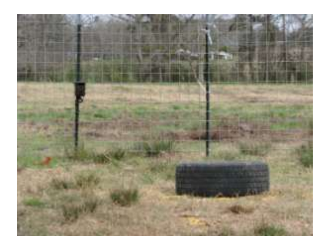
Continue feeding in and around the trigger while monitoring by camera.

There should be no guesswork involved as to whether you are successful at catching pigs once the trap is set. If you have trained the pigs to bait and then to the bait inside the trap properly (all documented by camera), you should be virtually guaranteed to be successful!