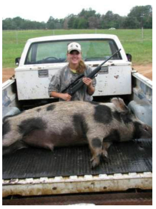
Approximately 24 hours after the two boars were patterned, a shooter returned and successfully removed the 317 pound boar.

If a large sounder of pigs is documented at the bait site, the landowner may be better served to erect a trap rather than shoot into the sounder removing only one or a few pigs at a time. The hard part is over—the pigs are on bait and trapping can remove larger numbers as compared to shooting.