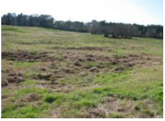
Pasture damage by wild pig rooting is a common problem for Texas landowners.

The steps for training pigs to bait are the same regardless of whether the landowner plans to shoot or trap the pigs. Step 1 is to identify that pigs are present—hopefully based on their sign left behind and before damage begins. Damage is fairly obvious and on rare occasions landowners may even lay their eyes on a pig or sounder of pigs providing confirmation of their presence. Remember, there are but two kinds of landowners in Texas—those that have wild pigs and those that are about to have wild pigs. In addition, there are but two kinds of wild pigs—those causing damage and those about to cause damage!