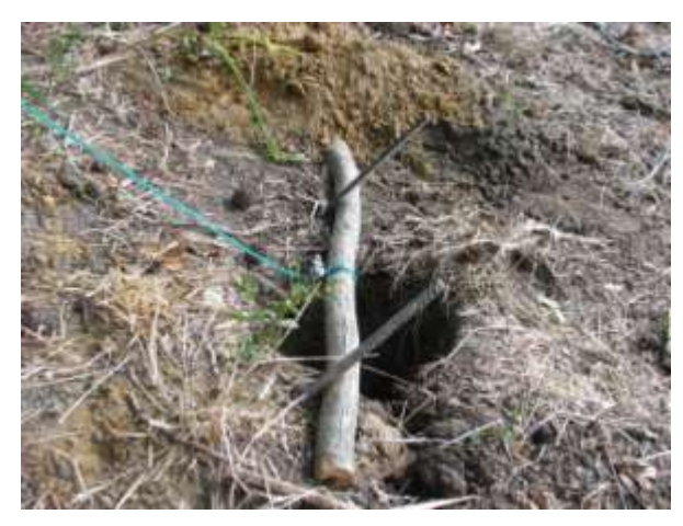
Rooter stick trigger using a post hole that will be filled with bait. Smaller pigs root less than adults.

Late on the afternoon that you set the trap to catch, place bait in a horseshoe pattern around the inside of the trap, maybe two or three feet inside of the panels. If smaller pigs are in the sounder, they will go to this bait first. Place sufficient bait around the trigger used. This is where the tire used as a trigger really shines. (Small pigs are the first to go in a trap followed by the sows and younger boars with the larger boars in last—if they are even running with the sounder at all). Often mature boars show up at a bait site on a different time schedule than a sounder- unless a sow is in estrous. Bait is placed under, around and even inside the old tire that is tied to the tripwire trigger. Smaller pigs cannot easily move the tire, so tripping the trap is delayed until larger pigs are present. The idea is for the last pig to be inside the trap before the first pig trips the trigger releasing the gate. The larger the sounder of pigs, the greater distance needed between the gate and the trigger and therefore the more bait placed between the gate and trigger—which means employing a larger trap. The idea is for the sounder to feed their way methodically back to the trigger—not rush the trigger immediately upon entering the trap. The delay in tripping the gate works in your favor by allowing more time for the entire sounder to enter the trap before the gate is tripped.