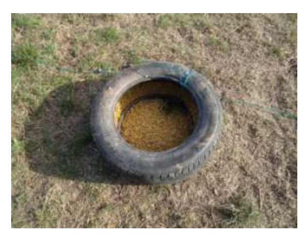
A tire trigger usually requires a larger pig to flip the tire in order to trip and close the gate.