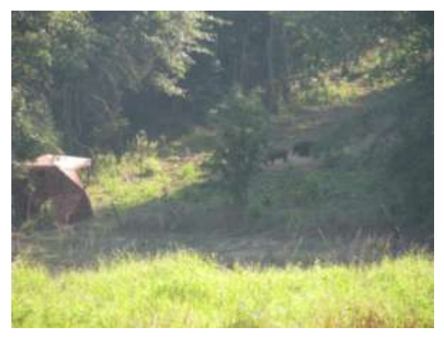
A blind can be setup downwind from a baited site. Note pigs feeding at the site.

This technique is particularly efficient on large solitary boars that have proven difficult to trap. In fact, it is a method often used adjacent to a trap site where a sounder of pigs has already been removed by trapping and where the boars are consistently photo-captured but remained reluctant to enter the trap itself.