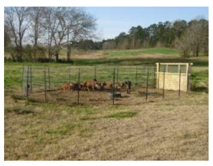
After pre-baiting and using best management practices, this sounder of 21 pigs was captured in less than two weeks. However, if additional pigs are photocaptured but not trapped, wire the gate open and start feeding outside the trap again with camera monitoring.

For absentee landowners that may visit their properties only occasionally or on weekends, employ a deer feeder (where legal) with a camera. However, the use of a feeder does restrict the bait choices that can be offered to shelled corn and perhaps a few other baits that funnel thru the feeder without stopping it up. I prefer to set the feeder to go off shortly after dusk and then again after midnight—in other words when pigs are likely to be the most active. One word of caution—be sure and stake the feeder legs in place, otherwise pigs can and will overturn the feeder and damage the mechanism. Once the camera confirms pigs on bait, erect the trap as described but position the feeder so it initially feeds both inside and outside the gate and then progressively only inside toward the back of the trap. These two devices used in tandem can take much of the guesswork out of the process but still allow the absentee landowner to effectively reduce pig numbers at their convenience.