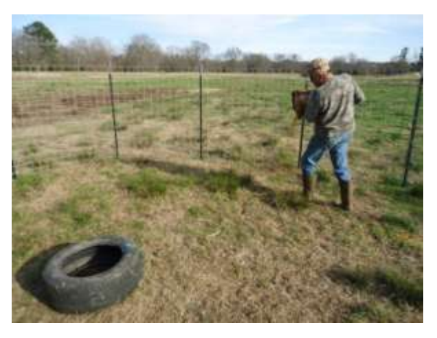
Placing bait inside the trap.