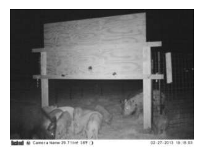
As the pigs begin to feed inside the trap, more bait is offered inside and less outside.