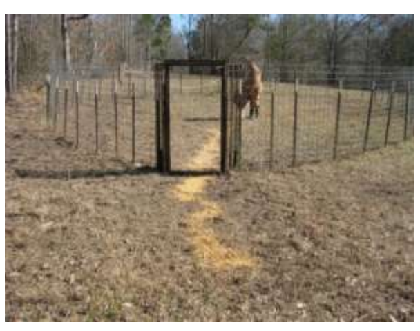
Note the line of bait extending from well outside to deep inside this trap as part of the pre-baiting process.

It may take several days for the pigs to accept the presence of the new trap. Once the pigs are back on bait, continue to progressively offer less bait on the outside and more inside the trap. As the pigs enter the trap consistently, you may want to move the camera to the back of the trap and record the pig activity as they enter through the gate opening.