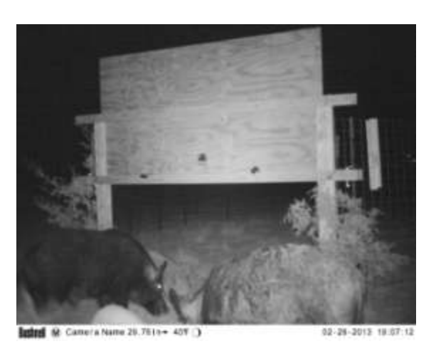
Pigs will initially feed up to the open gate but it may take several days for them to enter trap.