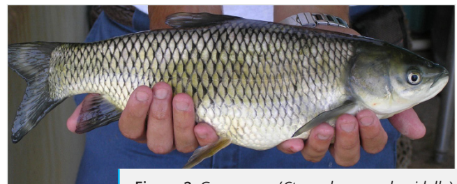
Figure 2. Grass carp ( Ctenopharyngodon idella ).

Grass carp (Fig. 2), also known as white amur, are native to rivers that flow through Western Asia. Fish from natural populations in the wild are diploid (i.e., two sets of chromosomes) and will reproduce in flowing waters under ideal conditions. To create triploid grass carp, fertilized eggs of diploid grass carp are subjected to temperature or pressure shock, making the grass carp triploid (i.e., contains three sets of chromosomes versus two sets for diploids). This extra set of chromosomes makes triploid grass carp sterile—unlike their diploid counterparts—and ensures that if fish do escape into non-impounded waters, they will not reproduce.