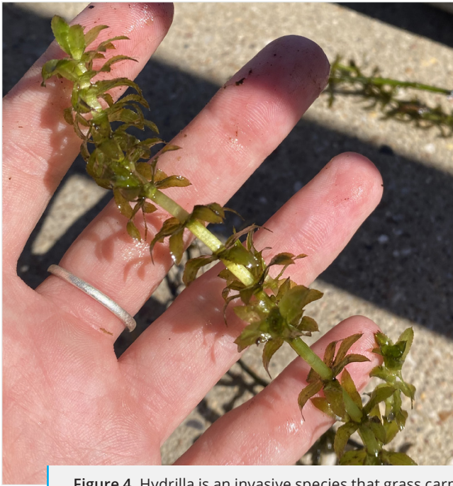
Figure 4. Hydrilla is an invasive species that grass carp consume in large quantities, but control can be difficult using grass carp alone due to the fast growth rate of hydrilla except for at higher stocking rates of grass carp.

Grass carp are most effective at controlling tender, submerged species of aquatic vegetation and a few small species of floating vegetation. They favor mostly soft vegetation with limp systems submerged in the water column (Table 1). They do not offer control for emergent plants they cannot reach, or tough, fibrous, woody or waxy species, and offer little to no control of filamentous algae or phytoplankton. Plant species with hard stems, stiff leaves, or spikey projections are not preferred by triploid grass carp—making them a less than desirable control option for those species. Coontail ( Ceratophyllum demersum ) and Watermilfoil ( Myriophyllum spp.) are both examples of submerged aquatic vegetation that grass carp will not typically be effective controlling. For some species of vegetation, such as Coontail, which are not preferred food items, triploid grass carp can eventually offer good control, but typically only after they have eaten all of the more palatable vegetation within the pond.