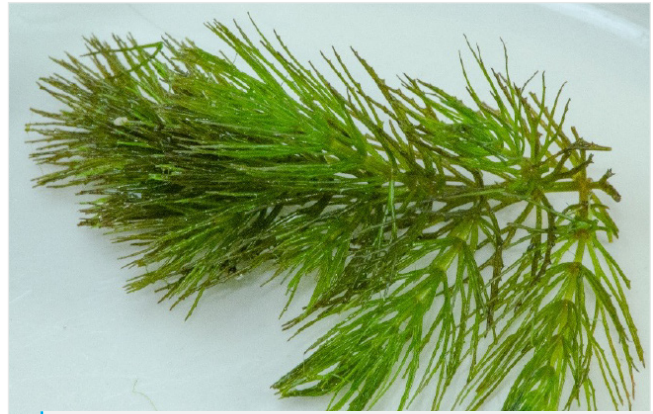
Figure 5. Coontail, also known as hornwort, is not a preferred food item for triploid grass carp due to the spikey or horn-like projection that can irritate their mouth and throat. Triploid grass carp can eventually offer good control of Coontail, but typically only after they have eaten all of the more palatable vegetation within the pond.

While grass carp do prefer young growth of macroalgae, which is called Muskgrass ( Chara spp.), they are not an effective control option for filamentous algae species and will generally only consume small amounts when they are noticeably young and small. Aquatic vegetation that grows mostly at or above the water's surface (e.g., water lilies or rushes) are generally not consumed by grass carp under normal conditions.