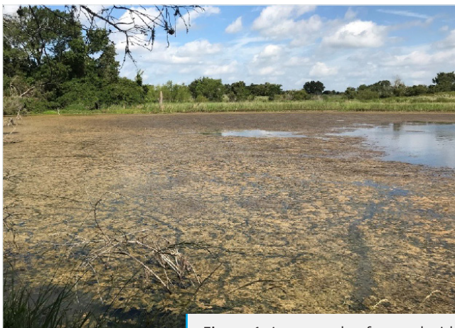
Figure 1. An example of a pond with severe aquatic vegetation growth.

Aquatic vegetation is a common problem in ponds, which can lead to low, dissolved oxygen fish kills, increased water evaporation, reduced access for recreation, reduced fish growth, and many other issues (Fig. 1). In addition to mechanical, physical, and chemical control options, biological control is an efficient, relatively inexpensive way to manage some nuisance aquatic vegetation populations. Traditionally, biological control is described as using a natural enemy to target a specific organism. For example: Releasing the Alligatorweed flea beetle ( Agasicles hygrophila ) to reduce Alligatorweed ( Alternanthera philoxeroides ) populations. Both organisms are native to South America and Alligatorweed is the only known host for the Alligatorweed flea beetle. Other biological control options include using fish species that are herbivores—meaning their diet consists of plant material. These fish species consume an array of palatable aquatic vegetation species, but they do not work for all species of aquatic plants.